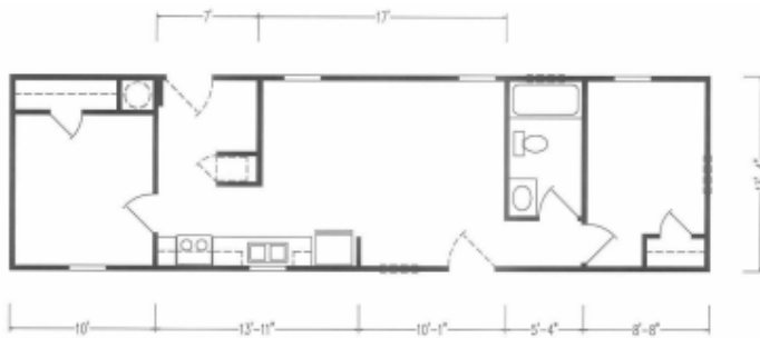
B117 4814 (640 SQ FT) 2 BEDROOM—1 BATH