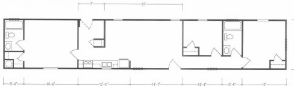
B175 7614 (1,015 SQ FT) 3 BEDROOM—2 BATHS