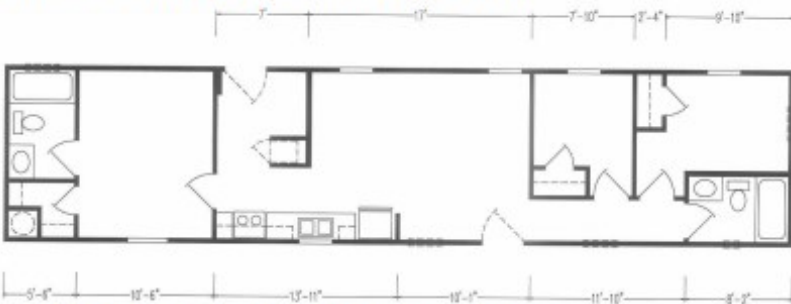
B155 6014 (800 SQ FT) 3 BEDROOM—2 BATHS