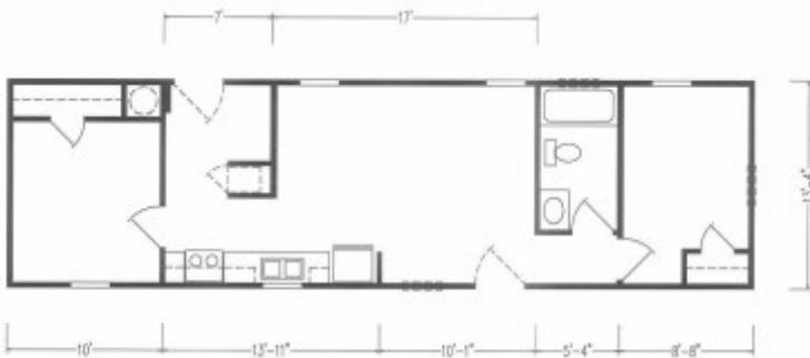
B117 4814 (640 SQ FT) 2 BEDROOM—1 BATH