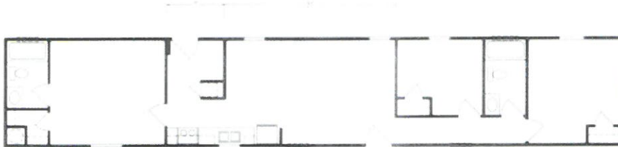
B175 7614 (1,015 SQ FT) 3 BEDROOM—2 BATHS