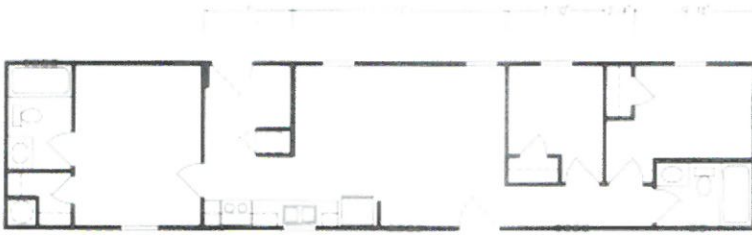
B155 6014 (800 SQ FT) 3 BEDROOM—2 BATHS