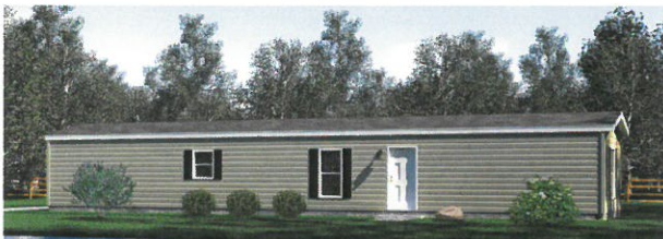
The Porter 24515 907 SQ FT • 2 BR • 2 BATH